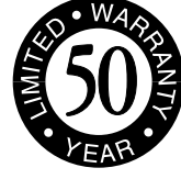
Heritage Premium Heritage Vintage

Transferability: The Owner of Heritage, Heritage IR, Heritage Woodgate, Heritage Premium and Heritage Vintage shingles may transfer this Limited Warranty one (1) time during the first five (5) years of the Term to a Purchaser of the building upon which the Shingles are installed. The Owner of Elite Glass-Seal and Glass-Seal shingles may transfer this Limited Warranty one (1) time during the first two (2) years of the Term to a Purchaser of the building upon which the Shingles are installed. The transfer must occur simultaneously with the sale of the building. To transfer this Limited Warranty, the Owner must provide TAMKO with written notice within thirty (30) days after the transfer. The written notice must include the names of the Owner and the Purchaser, the address of