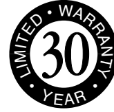
Heritage, Heritage IR Heritage Woodgate

Service or other reputable weather agency records winds or gusts in excess of the designated wind velocity for the product in the county, parish, regional district or municipality where the Shingles are installed or in any adjoining county, parish, regional district or municipality. Exposure of the Shingles at any time to winds or gusts in excess of the designated wind velocity for the product shall extinguish all obligations of TAMKO under this Limited Wind Warranty and all applicable implied warranties and conditions.